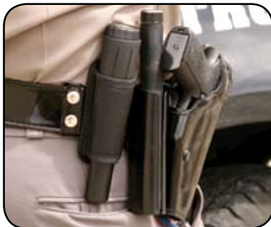
Ballistic weave holster (included) mounts easily on belt or in patrol car.